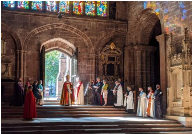
Bishop Mark stands on the threshold of the West Door and prays a blessing over the city, county, and diocese.

On a bright autumnal day, with the sun illuminating in multi-coloured splendour the almost empty nave, the scene was set for the special occasion.